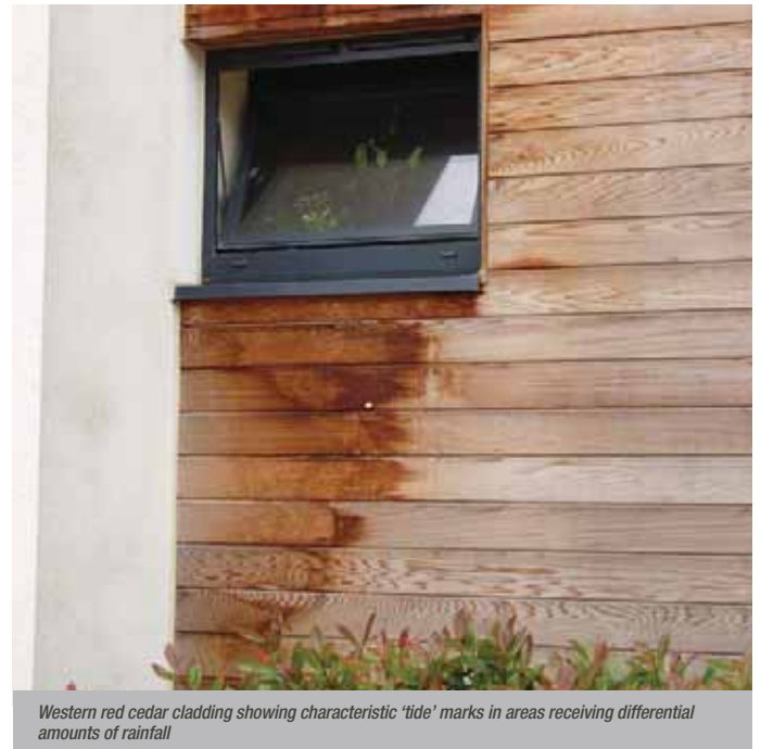
Western red cedar cladding showing characteristic 'tide' marks in areas receiving differential amounts of rainfall

surface of the wood. Normally rainwater running down the cladding would wash these extractives away (potentially discolouring other cladding, such as render, below). If the timber cladding is sheltered fully or partially from rain water, these extractives will still come to the surface but will not be washed away and can result in surface staining.