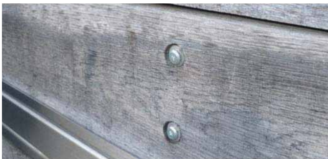
Screw fixing of hardwood cladding

Annular ring shank nails (sometimes called improved nails) only require point-side penetration of 2x the board thickness. For example, 40mm of nail penetration for a 20mm thickness board using 60mm length nails. Two nails are normally used at quarter points across the width of the board.